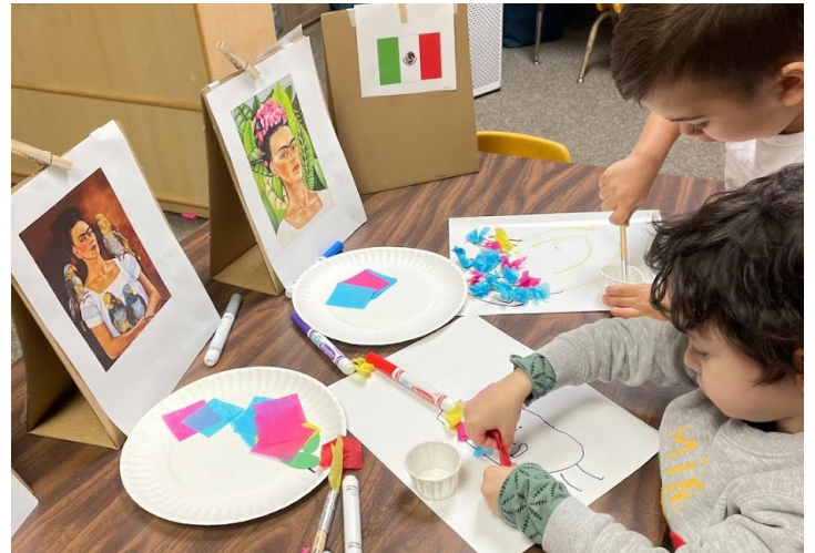
The preschool class spent some time working on the self-portraits, inspired by Frida Kahlo.