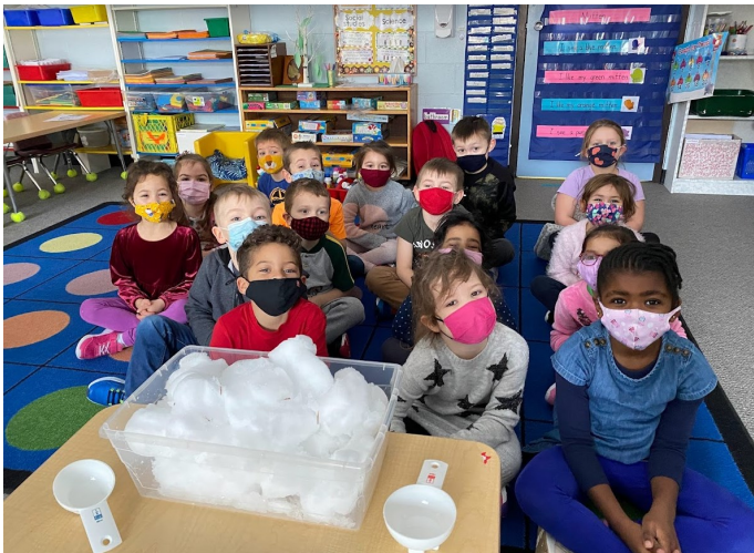
The kindergarten class collected and melted samples of snow. They used magnifying glasses to discover that snow that appeared clean had dust, animal fur, and other debris inside!