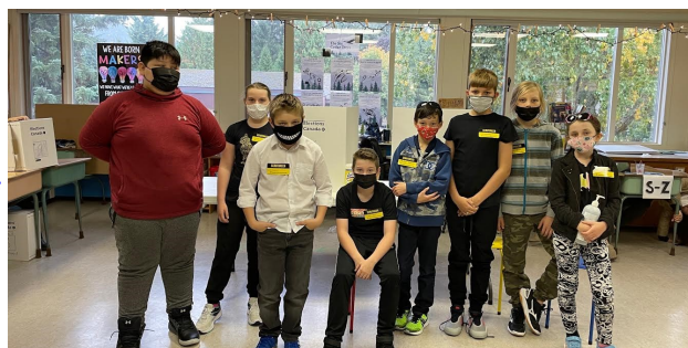
The grade 5 class ran a student vote as part of their Social Studies curriculum.