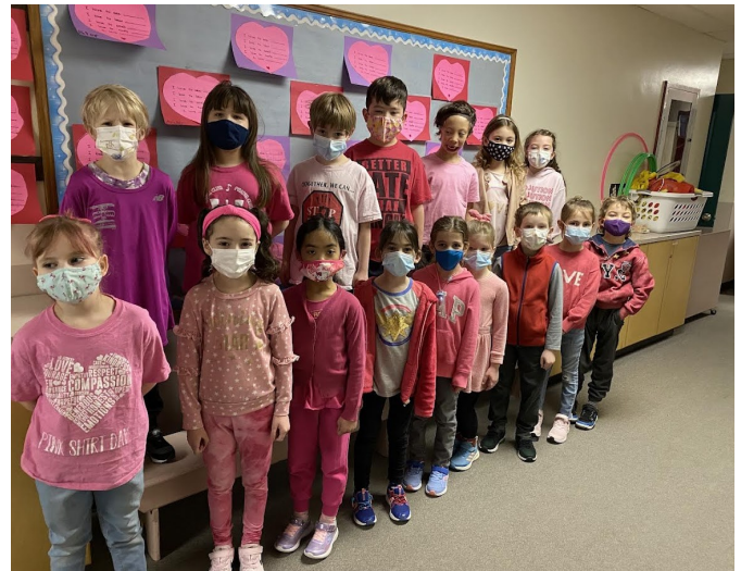
The Grade 1 class proudly displayed their PINK on Pink Shirt Day (February 23).

On 22/2/22, the Grade 1 class prepared their time capsule, to be opened on 3/3/33, which will be their Grade 12 year!