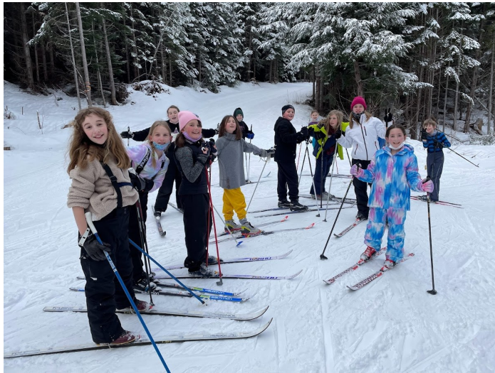
The Grade 4 and 5 classes loved their first day of cross country skiing at Onion Lake!