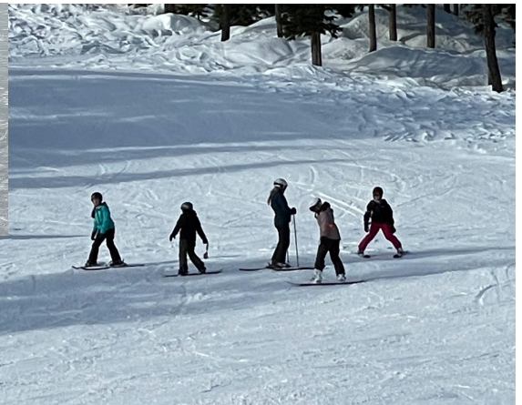
A great day of skiing was enjoyed by our Gr 6-9's at Shames!